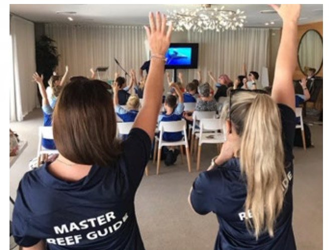
Access to Reef Seeker toolkit and educational resources to inspire students.