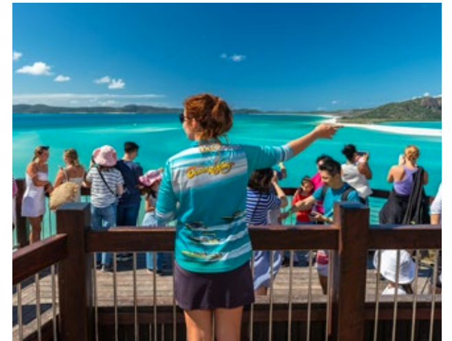
Trained Master Reef Guides, Marine Biologists and Eco Hosts!