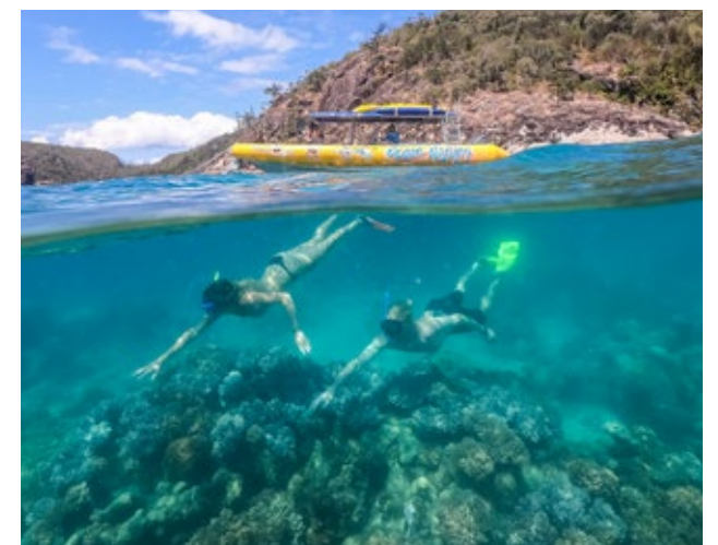
Free time to explore the GBR with guides. Extra time for species and threat identification.