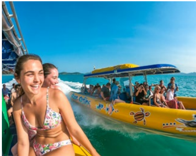
The fun side of education - experience the ultimate thrills on the ride of your life!