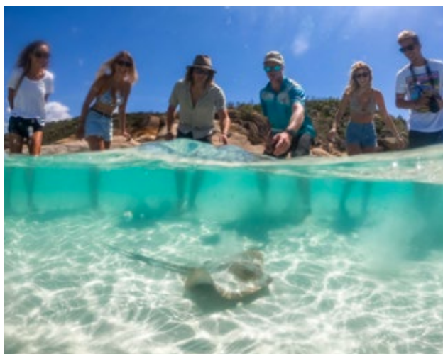
Guided and interpretive bushwalk to Hill Inlet lookouts and mangrove and shallows ecosystem.