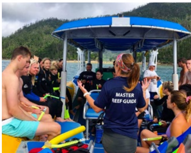
Post snorkel Q&A with data entry to GBRMPA's Eye on the Reef program.