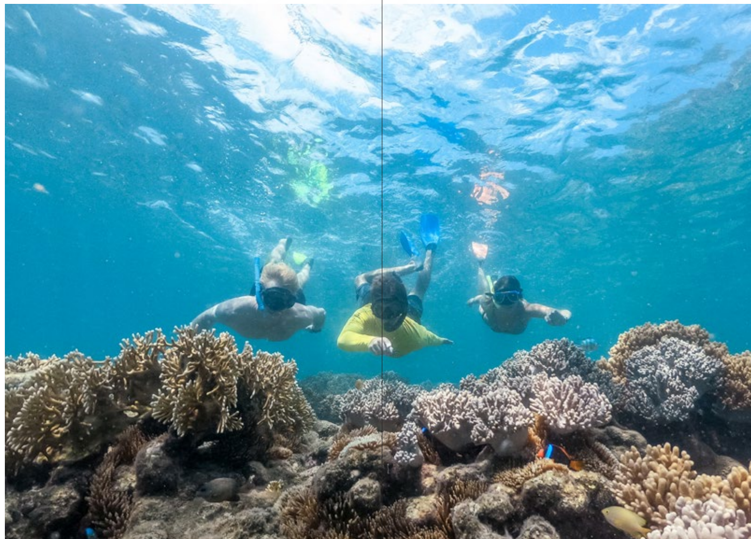
Guided snorkel with data collection exercise for GBRMPA. Use of underwater slate for data entry.