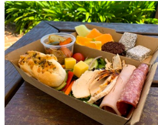
Fresh tropical lunch on the picture perfect Whitehaven Beach.