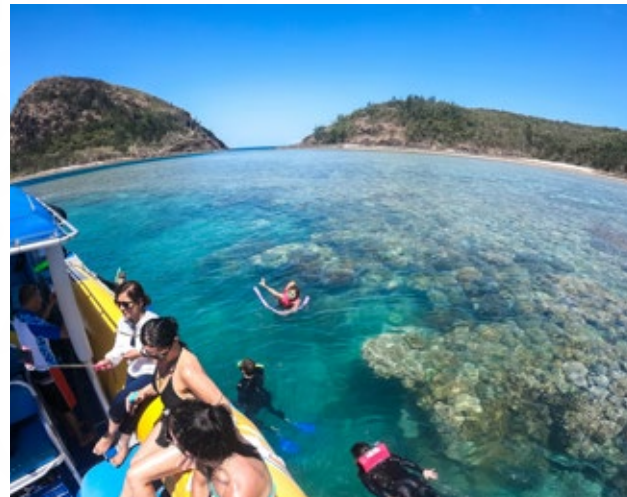
Experienced and qualified crew. Snorkel close to the boat with access to flotation devices.