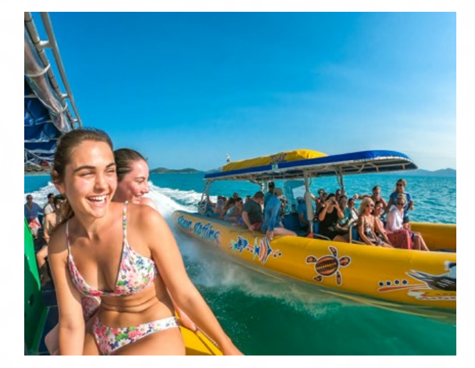
The fun side of education - experience the ultimate thrills on the ride of your life!