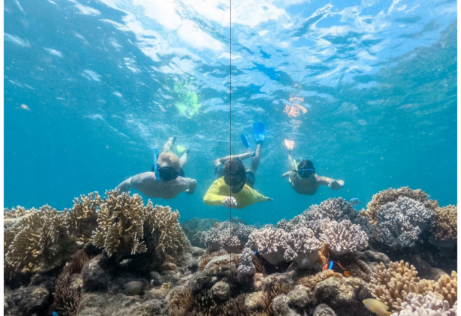
Guided and interpretive bushwalk to Hill Inlet Guided snorkel with data collection exercise for