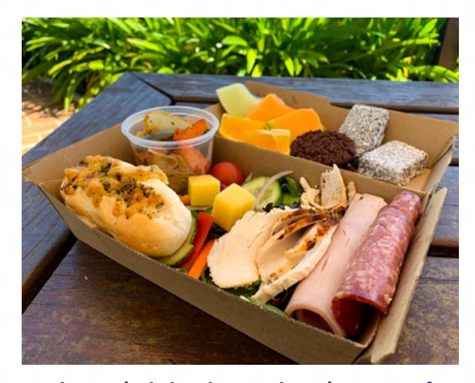
Fresh tropical lunch on the picture perfect Whitehaven Beach.