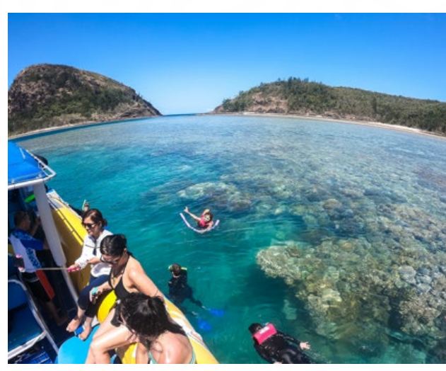
Experienced and qualified crew. Snorkel close to the boat with access to flotation devices.