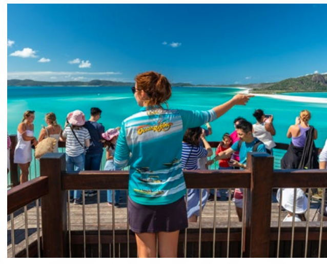
Trained Master Reef Guides, Marine Biologists and Eco Hosts!